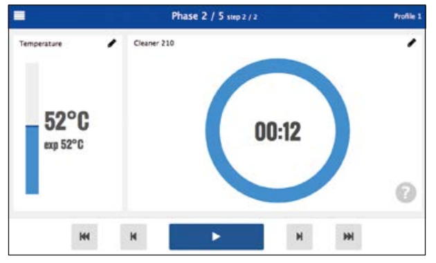
A new graphical user interface guides through all process steps

The integrated touch panel with wizard and parameter administration safely guides even inexperienced users through the galvanization process. Ambitious developers can customize the settings at any time. The process requires no knowledge of chemistry and no bath analyses, as the system automatically indicates the necessary maintenance steps. Another new feature is the chemical-resistant housing with improved resistance to discoloration – the Contac S4 combines functionality, good looks, and practicality.