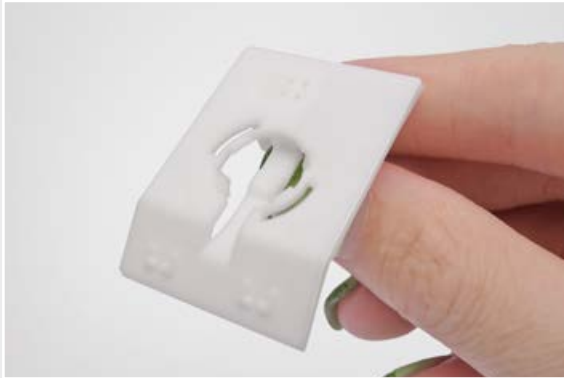
1. Creation of the three-dimensional part