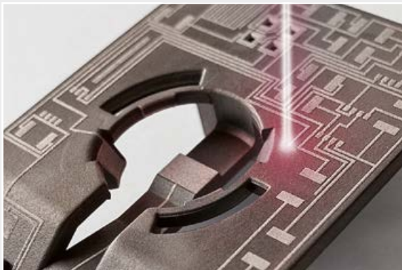
3. Structuring the circuit pattern with LPKF ProtoLaser 3D