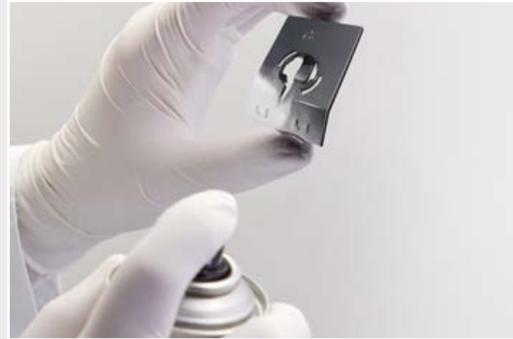
2. Painting the part with LPKF ProtoPaint LDS